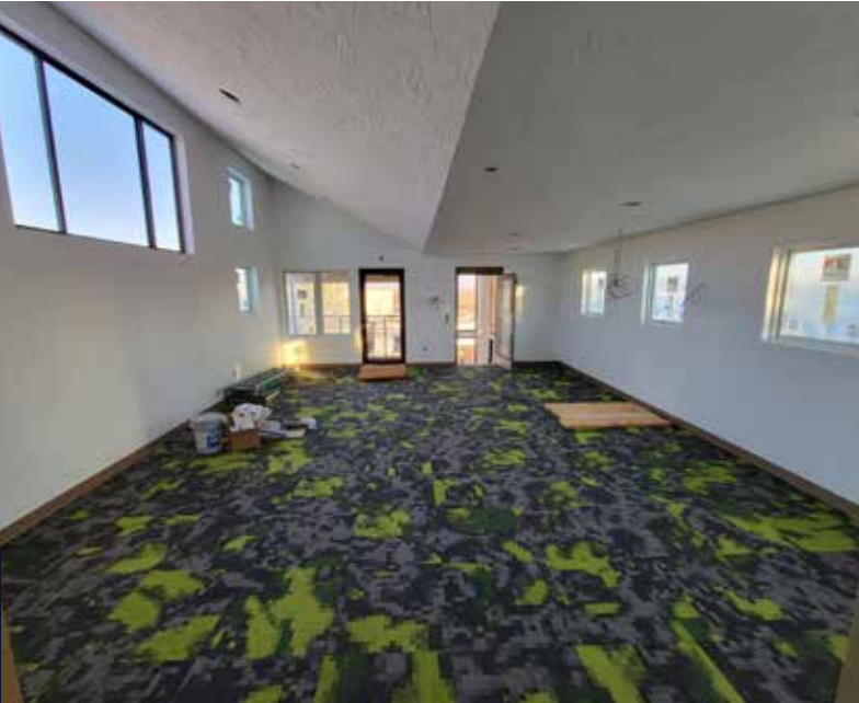
Newly completed interior